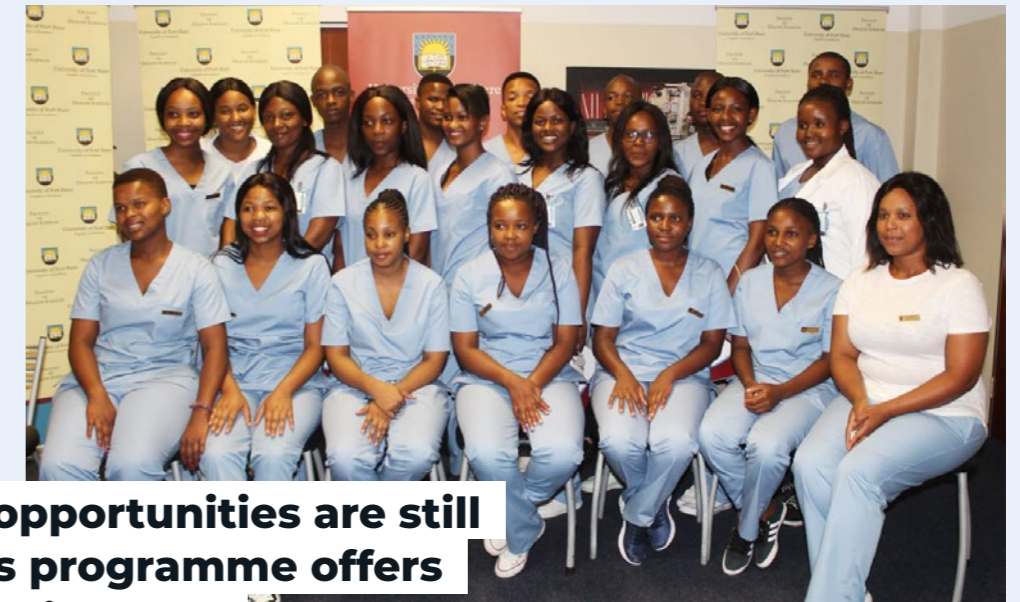
>> 2018 Cohort SLP Programme Students

“Employment opportunities are still plentiful as this programme offers a scarce skill nationally.”