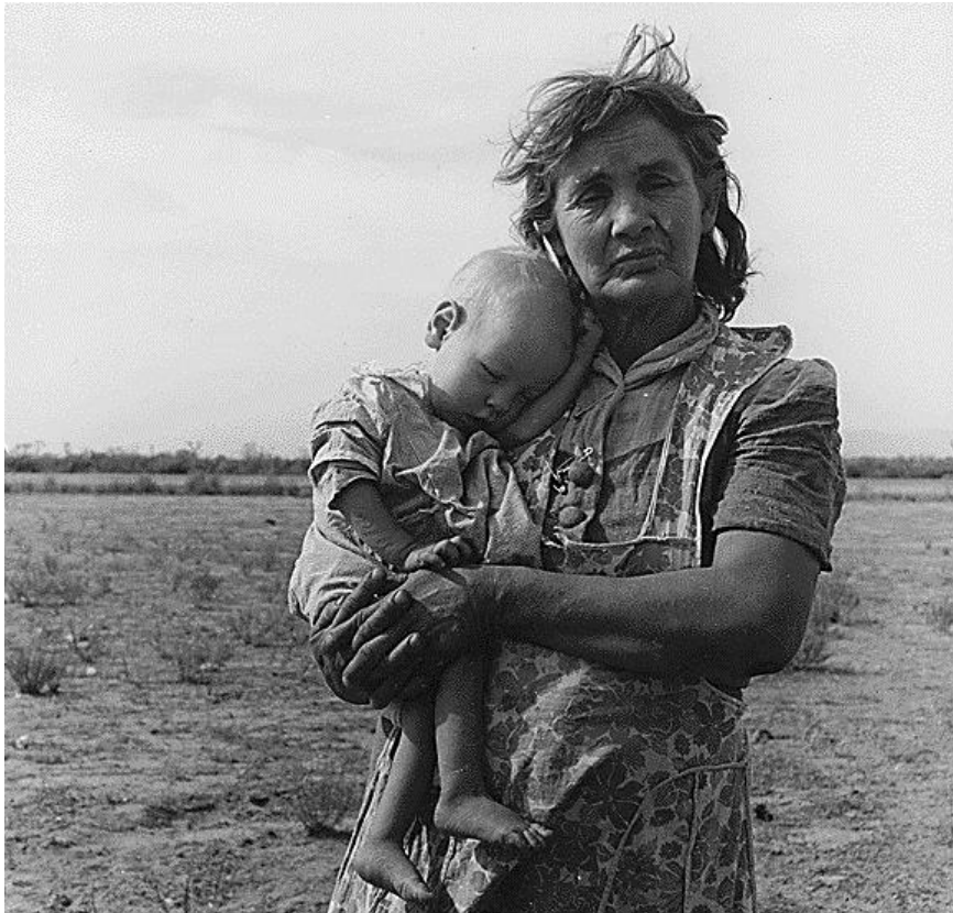
“Mother and child”

www.english.illinois.edu/maps/depression/photoessay.htm