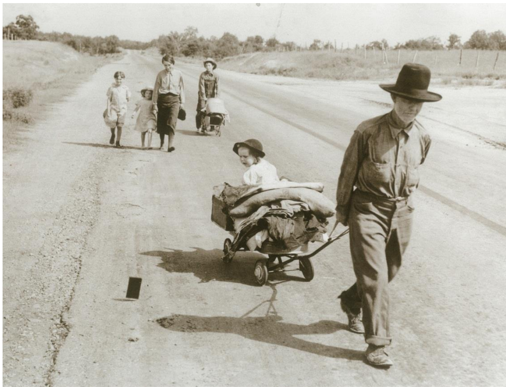
“Family walking on the highway”