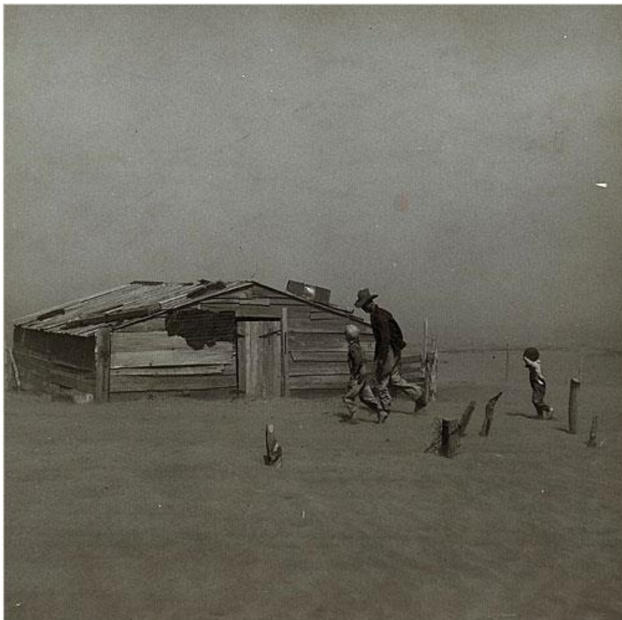
"Father and children seeking shelter"