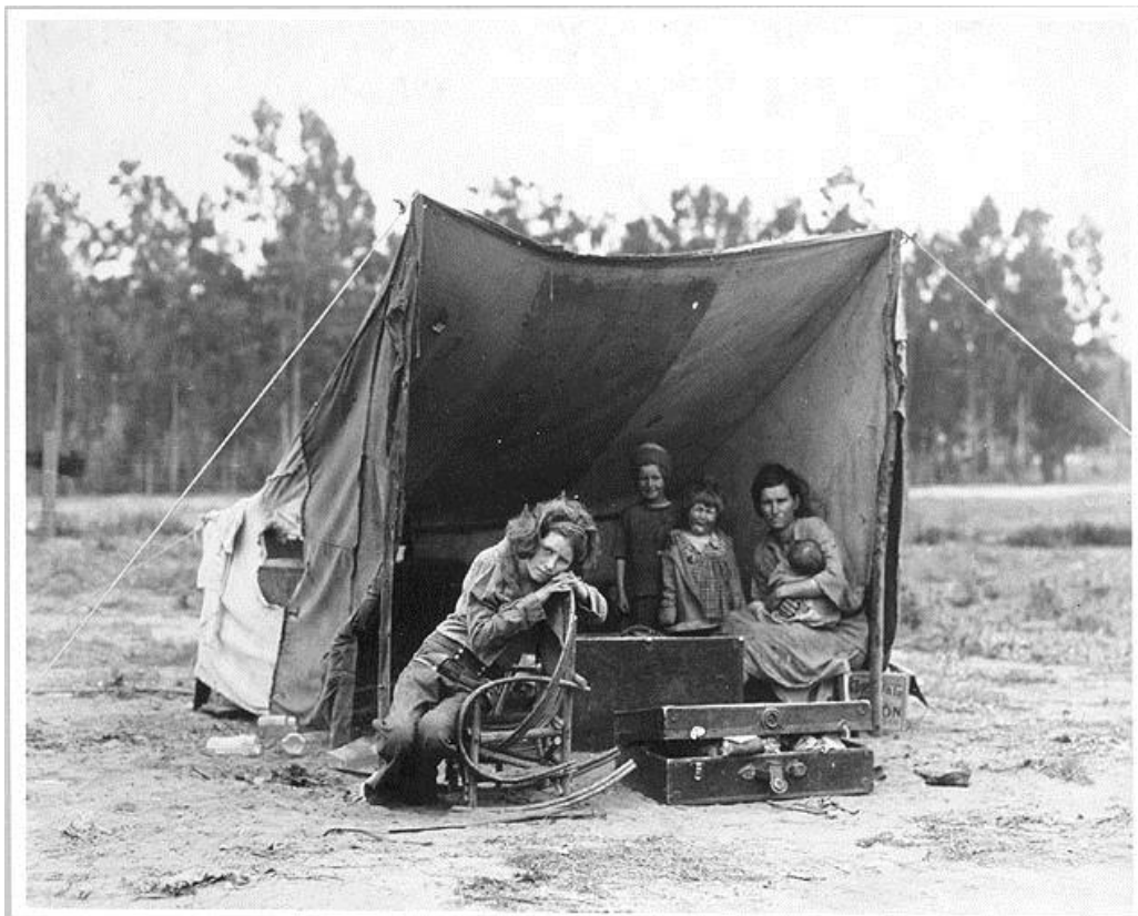
“Camping on the side of the road”