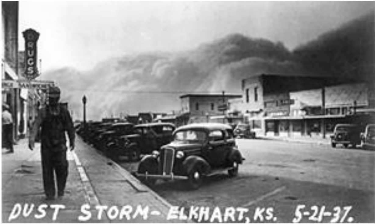
"Dust storm approaching, Kansas 1937"