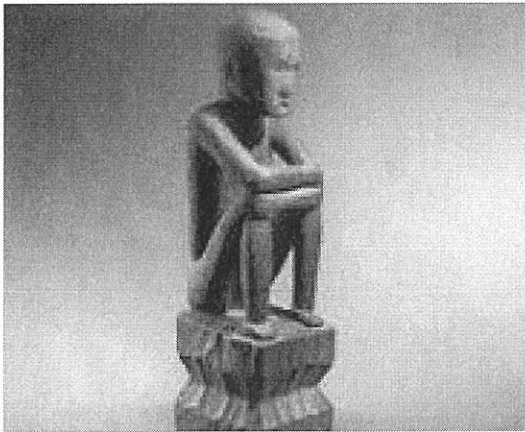
Igorot bulul (1920)

Use the artwork below to answer your questions.