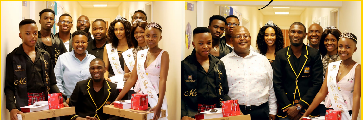
Mr and Miss Fort Hare competition: Top 6 receiving their prizes from the Dean of students and SRC. Prizes included: laptops, tablets, clothing and shopping vouchers, a photo-shoot etc.