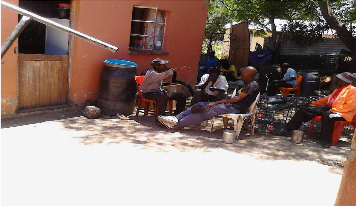
ANNEXURE D: Old age pensioners gathered to buy the home brewed alcohol.