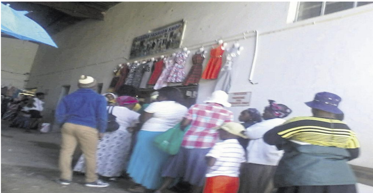
People line up outside the mashonisa's office in Mount Frere.

By NOMZAMO YUKU Tuesday, December 9, 2014 07:00