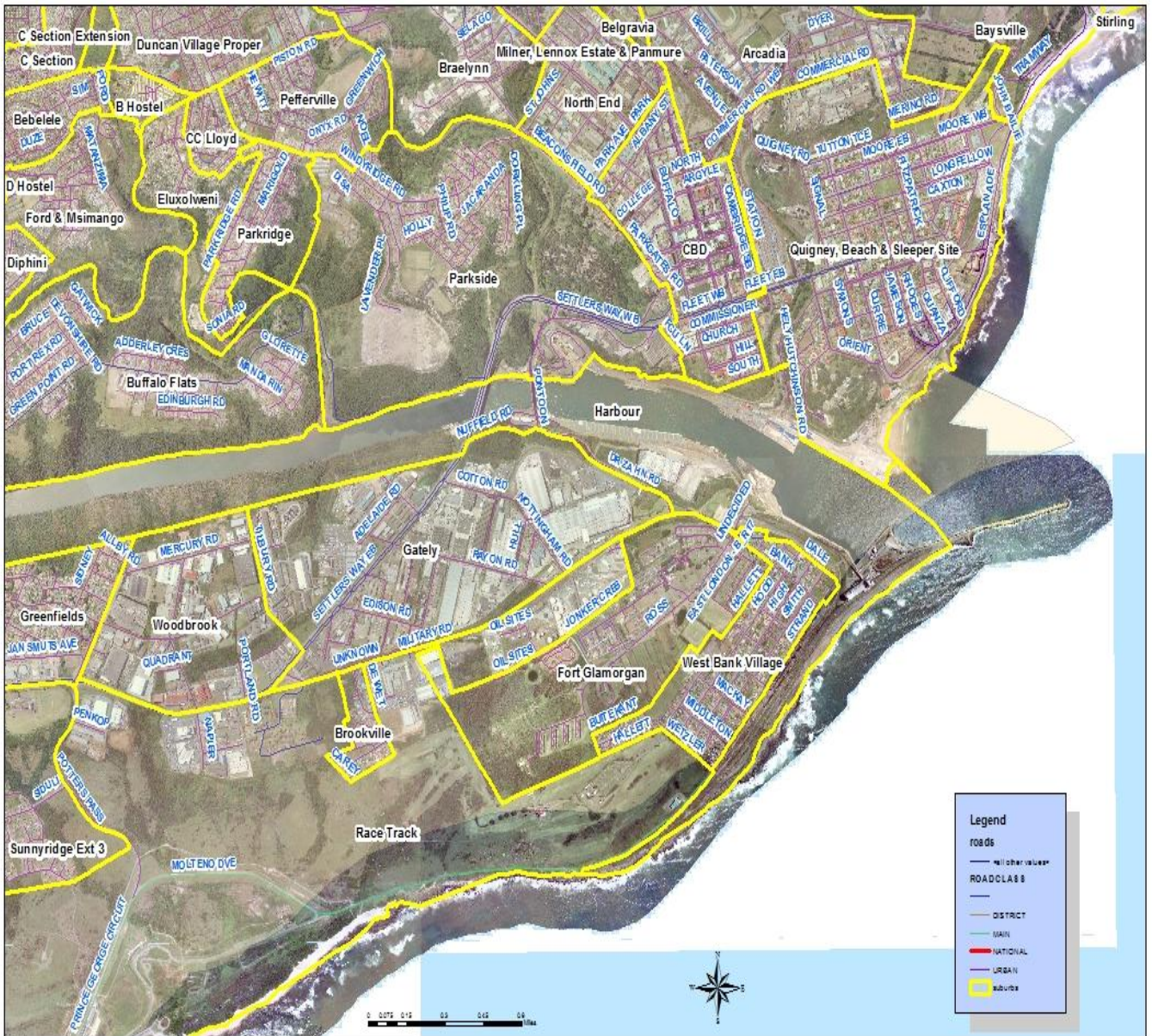
Figure 3: Map of East London