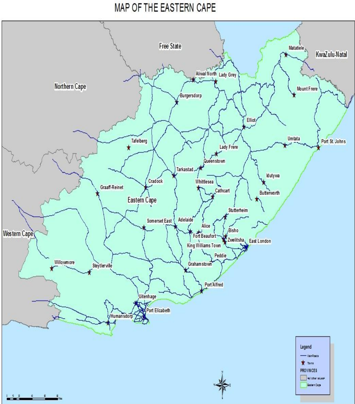
Figure 2: Map of the Eastern Cape