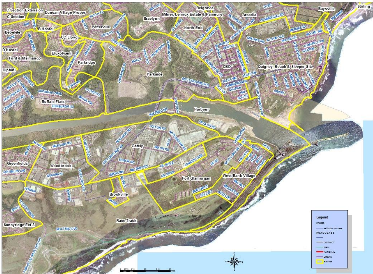
Figure 4: Inner city suburbs around East London CBD

escalating accommodation costs. Decent accommodation is now beyond the reach of many, with rental prices soaring to levels that many cannot afford. It has become a norm for more than ten people to occupy a single house. Hence, a single room can be shared by up to four or five people. This is one way in which people try to manoeuvre in order to survive in the city. Backyard shacks and illegal extensions of houses are characteristic of these suburbs.